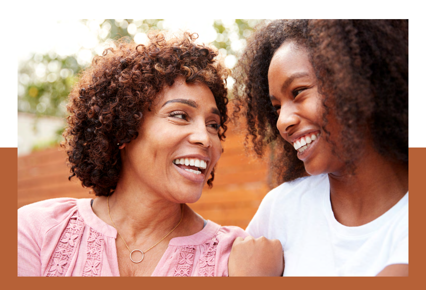
7. Do They Care for